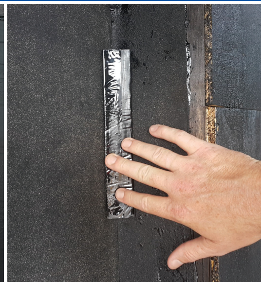
C – Filled to corner detach