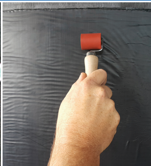
B – Gussets installed in high stress areas. Roller used to ensure good seal