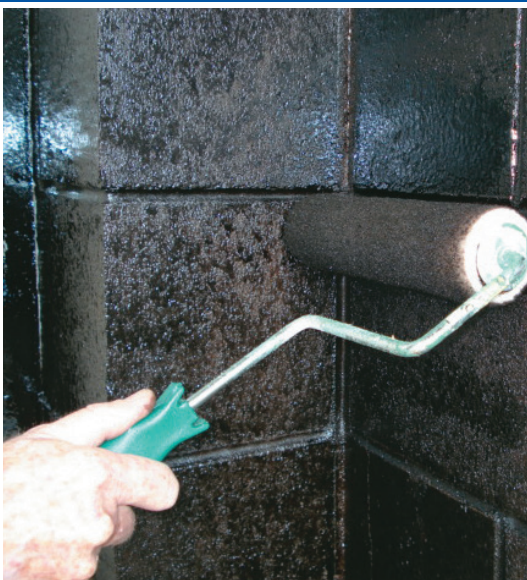
A – Nuraflux primer applied to substrate