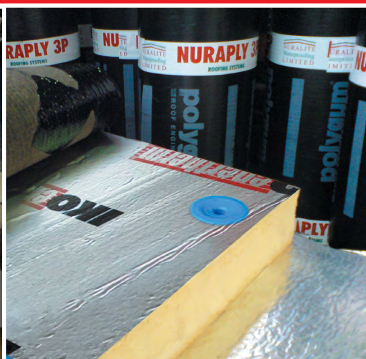
B) Self Adhesive Basesheet Installed