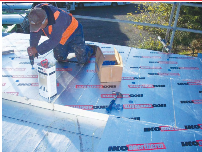
Insulation set out on plywood