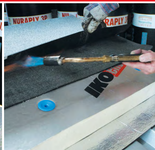
C) Weld Capsheet