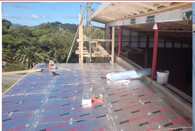
Insulation fixing on metal roofing